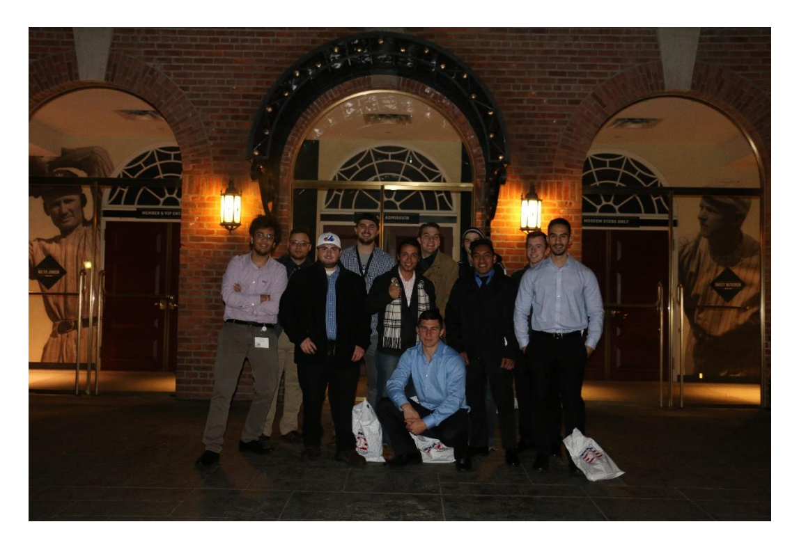
Figure 8: UMass Lowell Student Chapter at the Baseball Hall of Fame in Cooperstown, NY.