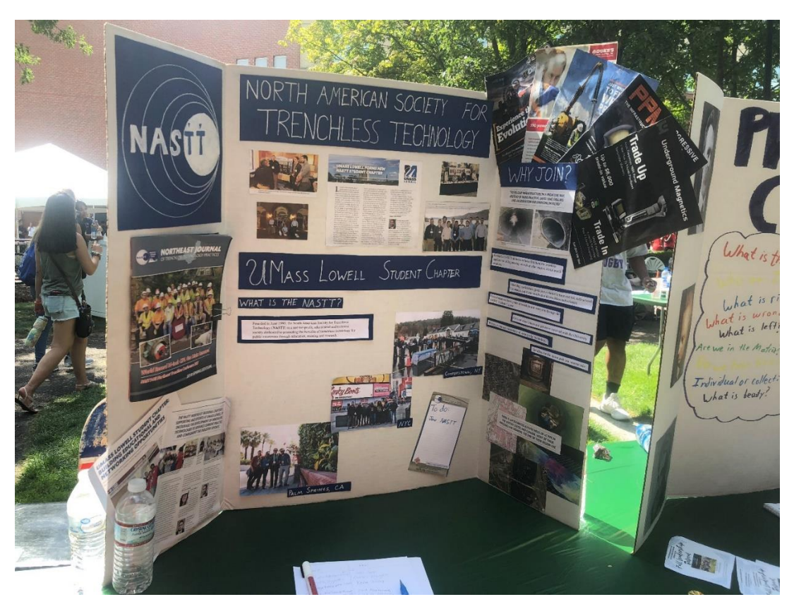
Figure 13: The presentation board used at the 2018 Fall engagement fair to recruit students.

As mentioned prior, NASTT Student chapter is continuing to expand in size, bringing on more new members each year. This year, since the chapter has been recognized as an official school organization, current members of the club were able to attend the annual engagement fair, presenting what the chapter does to new students. This, along with short presentations in freshmen classes, is proving to be moderately successful in attracting new members. The student chapter is making progress towards the goal to start a Northeast Trenchless Center for Education, Experience and Research at UMass Lowell with support from trenchless industry.