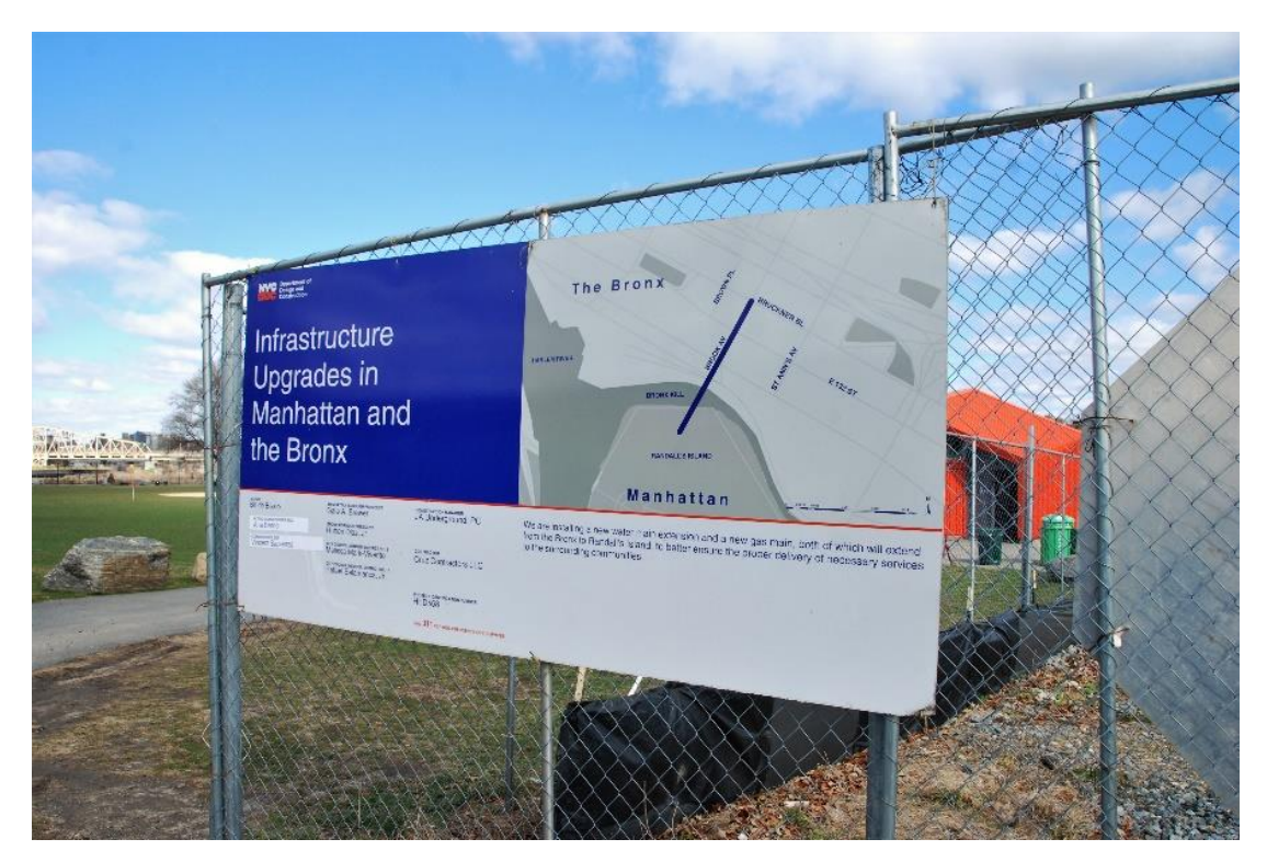
Figure 2: Details of the Randall's Island project site.